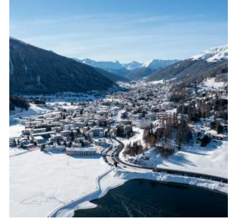
Davos was at the centre of reporting on accusations of antisemitism in Switzerland.