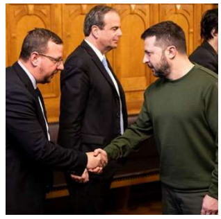
Zelenskyy in dialogue with Swiss politicians.