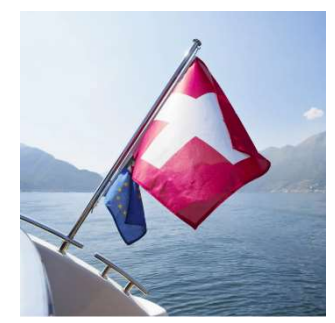
Resumption of negotiations between Switzerland and the EU