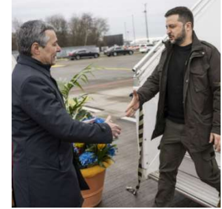
Zelenskyy's visit and the announcement of a peace conference in Switzerland received much media coverage.

would no longer be lent sports equipment due to negative experiences. Several reports pointed to similar previous incidents in Swiss touristic areas. A knife attack on an orthodox Jew in Zurich by a 15-year-old Swiss teenager with Tunisian roots also received a great deal of attention. The reporting remained mostly factual and Switzerland was not accused of being generally antisemitic. However, individual German media outlets discussed a study according to which antisemitic incidents in Switzerland had risen sharply in recent months.