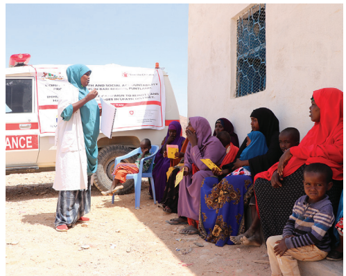
Immunization campaign in Ufeynd district (Bair, Puntland, Somalia)