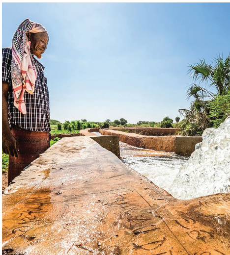
Irrigation water canal in Unaa village, Dollow

• Switzerland will continue contributing to positive change and progress in Somalia, and its neighbouring countries.