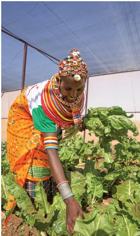
Ilbarok women's group garden

Covid-19 has affected national economies, caused increased unemployment, food insecurity, displacement and exposed corruption, leading to public mistrust. This has slowed down development efforts in the region.